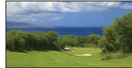
Makena: “Stunning” Views