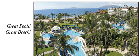
Great Pools! Great Beach!