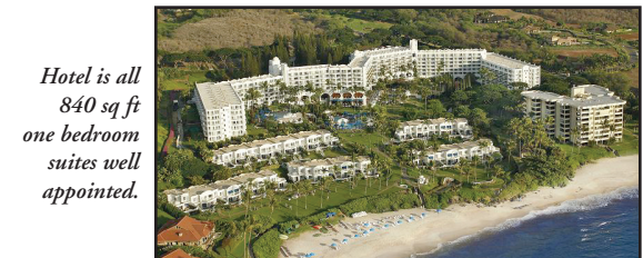
Hotel is all 840 sq ft one bedroom suites well appointed.