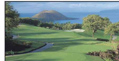
Wailea Emerald: “Every hole a picture framed”