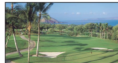
Wailea Gold: “As good as it gets for champion- ship golf”